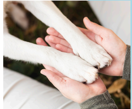
Owner and dog

The primary audience for Grieving Toto is for all genders and those who are 15 years old and above. With more research, Grieving Toto will be able to directly target the different generations accordingly. However, the app will be used by those who lost a dog in the past, present, and future. This app will have an age rating of 4+ which is considered to contain no objectionable material.