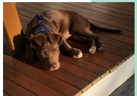
Jo-Jo, 4 month old Labrador Terrier Mix