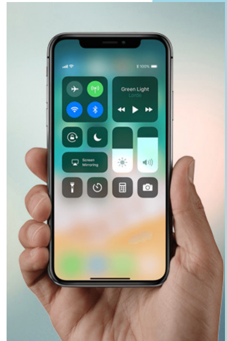
Apple iOS 11

Grieving Toto is a free app. Money to help maintain the app will come from donations from users who noticed how Grieving Toto has helped them. Another form of income to maintain the app is through sponsors which are directly connected with animals.