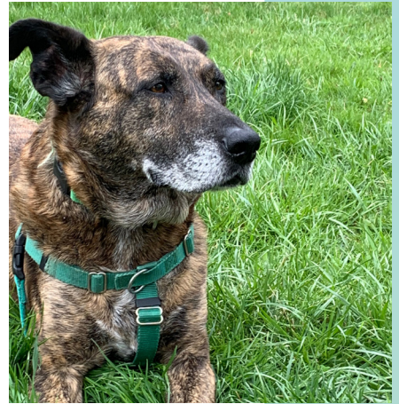
Beau, 9 year old Dutch Shepherd Mix