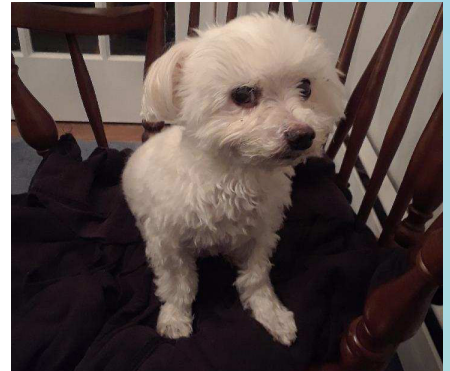
Marshmallow, 15 year old Maltese

I hope that Grieving Toto will not only help those who lost or will lose a dog but remind them that it is okay. It is only natural to grieve and there is a community that will support you as you journey through your grieving process.